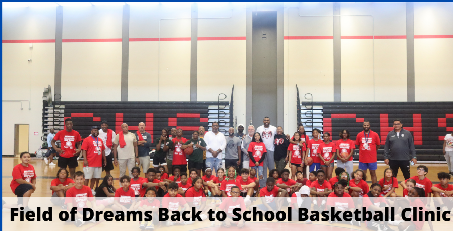
Field of Dreams Back to School Basketball Clinic

BRIDGEPORT PUBLIC SCHOOLS OFFICIAL NEWSLETTER