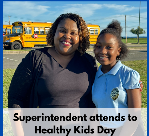
Superintendent attends to Healthy Kids Day